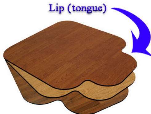
Cherry, Oak & Walnut

NOTE: All chair mats with a lip are listed using the overall size of the mat including the lip. Therefore, the rectangular "base" portion of the mat is smaller than the overall size listed.